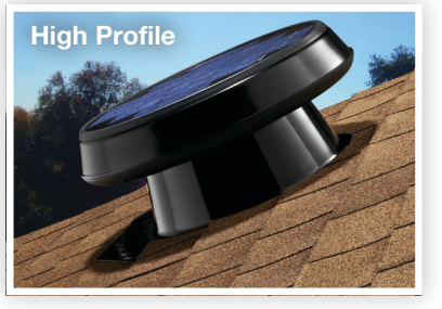
This unobtrusive, aerodynamic design is perfect for locations with heavy snow loads.

A great alternative for north facing roofs when you need to improve exposure to the sun.