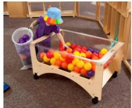
The Goddard School’s students in Chanhasen, Minn., greatly benefitted from the safety and durability of Jonti-Craft ’s products.

It isn’t too hard to see why Jonti-Craft has been the leading provider of early learning furniture for over 30 years. “We would recommend Jonti-Craft products to anyone, because of the high quality, craftsmanship, and durability that has long been associated with the company’s name.” Not only does Jonti-Craft have kid-tested features and customer service that is second to none, but they offer over 20 product categories and