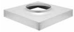
Curb-Mounted Cap (290 DS Only)