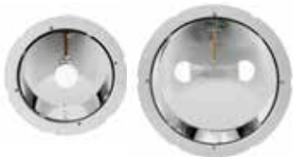
Light Add-On Kit