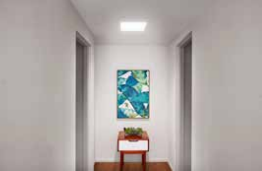
Residential Hallway Carlsbad, CA