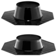
No Pitch Flashing