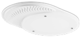
Ventilation Add-On Kit (160 DS Only)