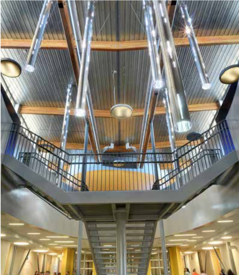
Red Hawk Elementary School Erie, CO