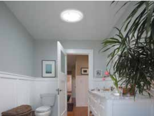
Residential Bathroom San Diego, CA