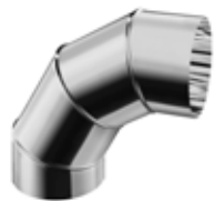
Spectralight Infinity 0-90 Degree Angle Adapter