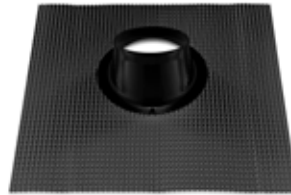
Universal Tile Flashing