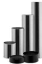
Flashing Turret Extensions