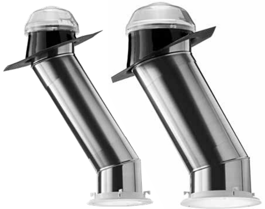
Solatube 160 DS

The Solatube 290 DS (14 in./350 mm diameter) provides approximately twice as much light as the Solatube 160 DS and, in addition to lighting small offices and corridors, can be a great solution for large areas such as conference rooms.