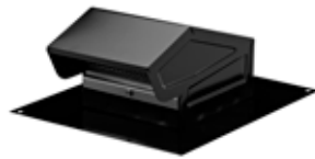
Roof Ventilation Cap (160 DS Only)