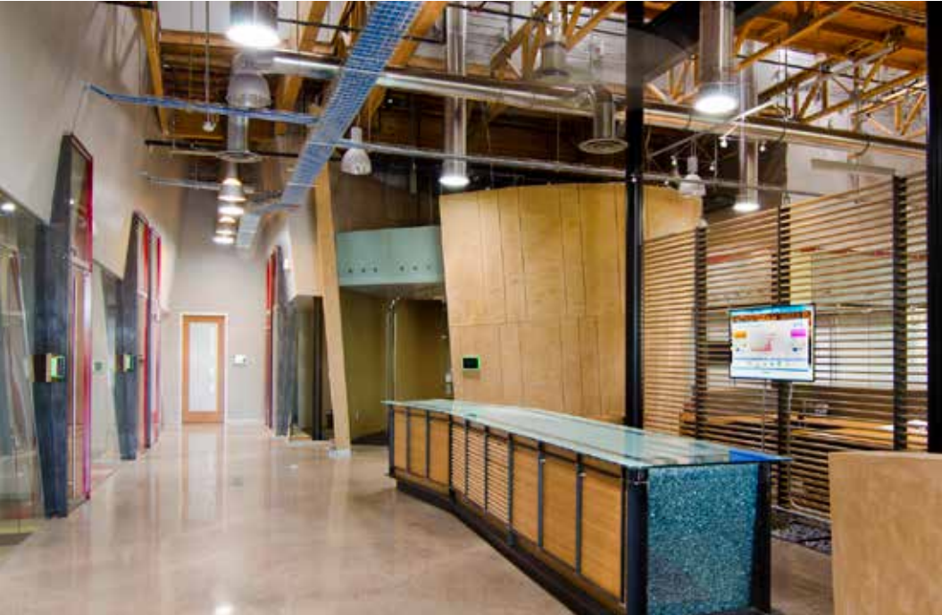
DPR Construction Phoenix, AZ