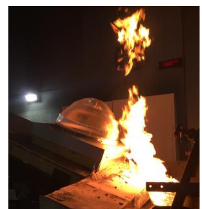
Testing conducted on 750 DS with Polycarbonate Inner Dome at the FM Global Research Campus in Glocester, RI.