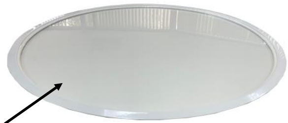
330 / 750 DS Rooftop Fire Glazing