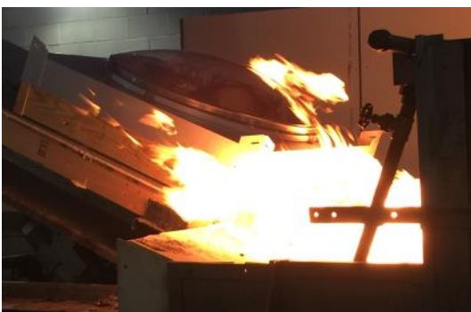
Testing conducted on M74 DS at the FM Global Research Campus in Glocester, RI.