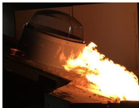
Testing conducted on 330 DS (Polycarbonate Dome) at the FM Global Research Campus in Glocester, RI.